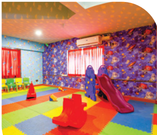
Kids Play Room