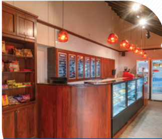
Cremeux The Café