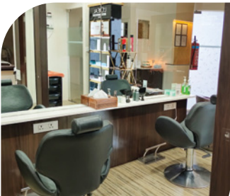
Saloon & Spa