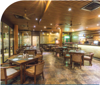
The Brasserie The Multicusine Restaurant & Bar