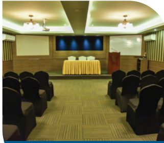
Lvl. 1- Conference Hall with inbuilt audio & video equipments