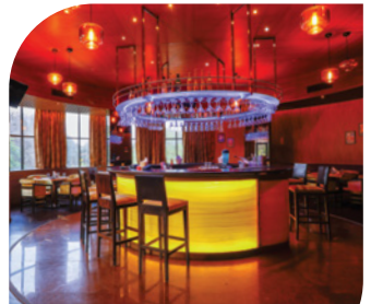
Redondo The Lounge Bar