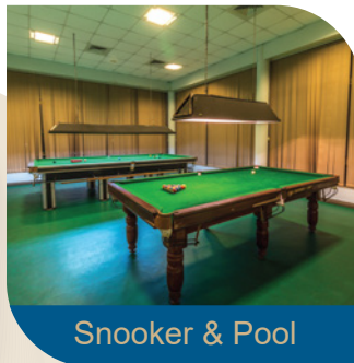
Snooker & Pool