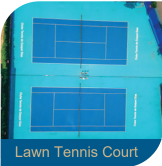
Lawn Tennis Court