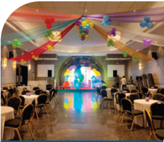
Sala de Gaspar